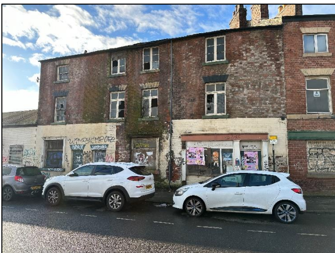
Harvest Lane Frontage

The total site area is approximately 0.1 acres.