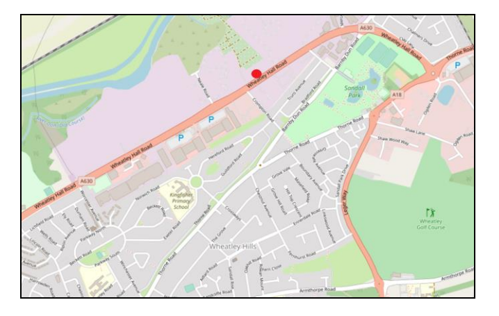
SUBJECT TO CONTRACT AND AVAILABILITY December 2023