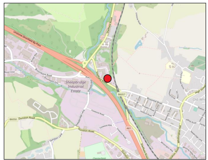
SUBJECT TO CONTRACT AND AVAILABILITY September 2023

For viewing arrangements, or any further information, please contact the landlord direct on 07973 800 573. Alternatively, you can email <a href="mailto:sheepbridge@btconnect.com">sheepbridge@btconnect.com</a>.