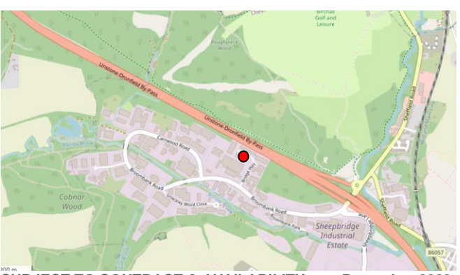
SUBJECT TO CONTRACT & AVAILABILITY